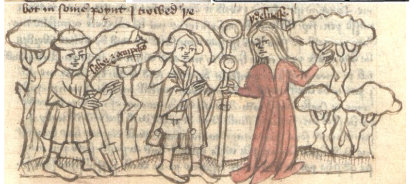
▲ ‘Labour/Labor et occupatio’ as matmaker and labourer The Pilgrimage of the Life of the Manhode , c. 1430. Melbourne, State Library of Victoria, MS 096/G94, fols. 45v and 47r