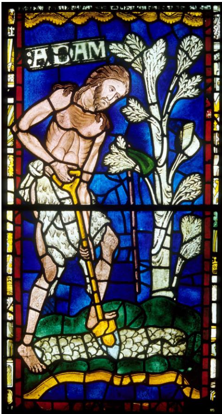
▲ Canterbury Cathedral, c. 1176